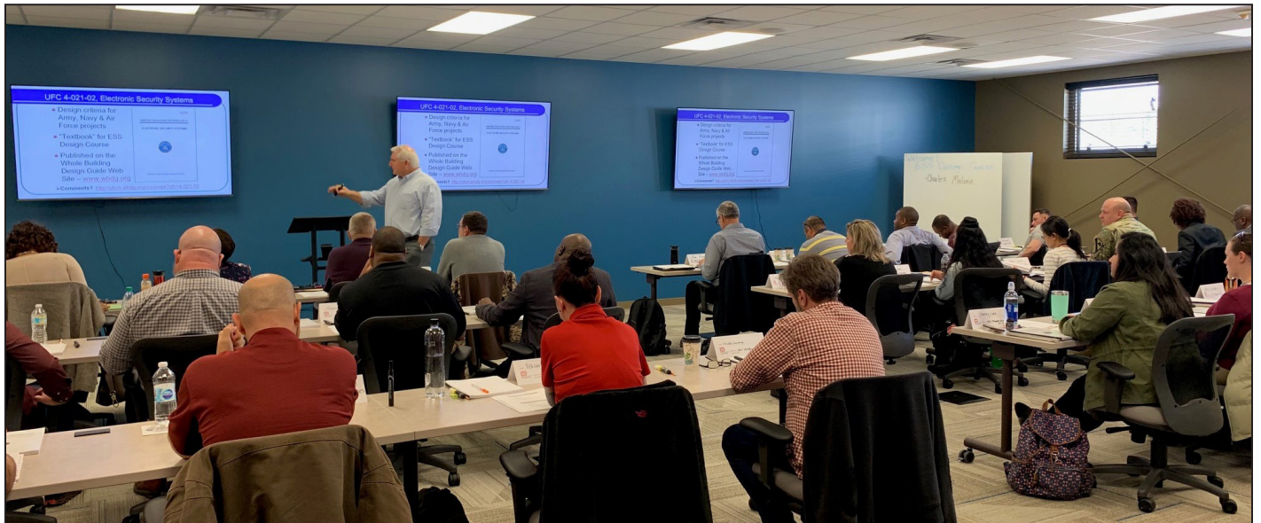
Pictured is the ESS Design Course in March 2019.

The ESS-MCX provides technical support services to the Army.