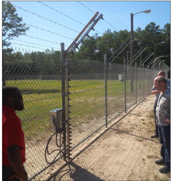
Members of Huntsville Center's Electronic Security Systems - Mandatory Center of Expertise participate in a technology demonstration at a Department of Defense test site.

Technical questions and requests for ESS-MCX services may be submitted via email to AskESSMCX@usace.army.mil